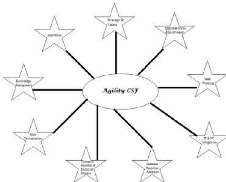
Figure 1: Agility Critical Success Factors